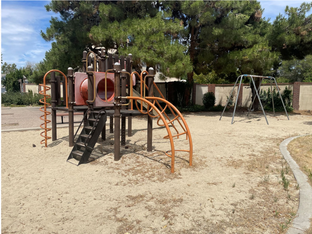
Photo: Mt. Oso Park Playground