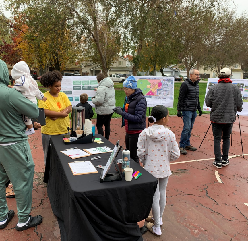
Photo: Florence Stevens Playground Renovation, Community Meeting