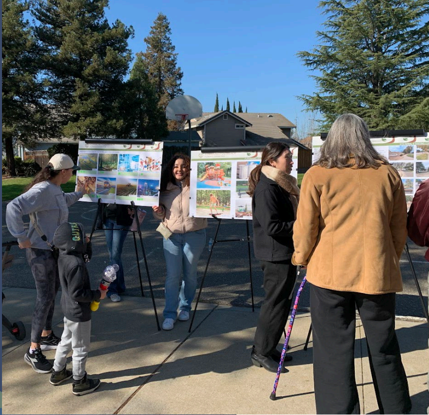
Photo: Florence Stevens Park, Community Meeting