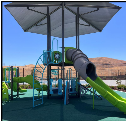
Daniel Ray Schack Park