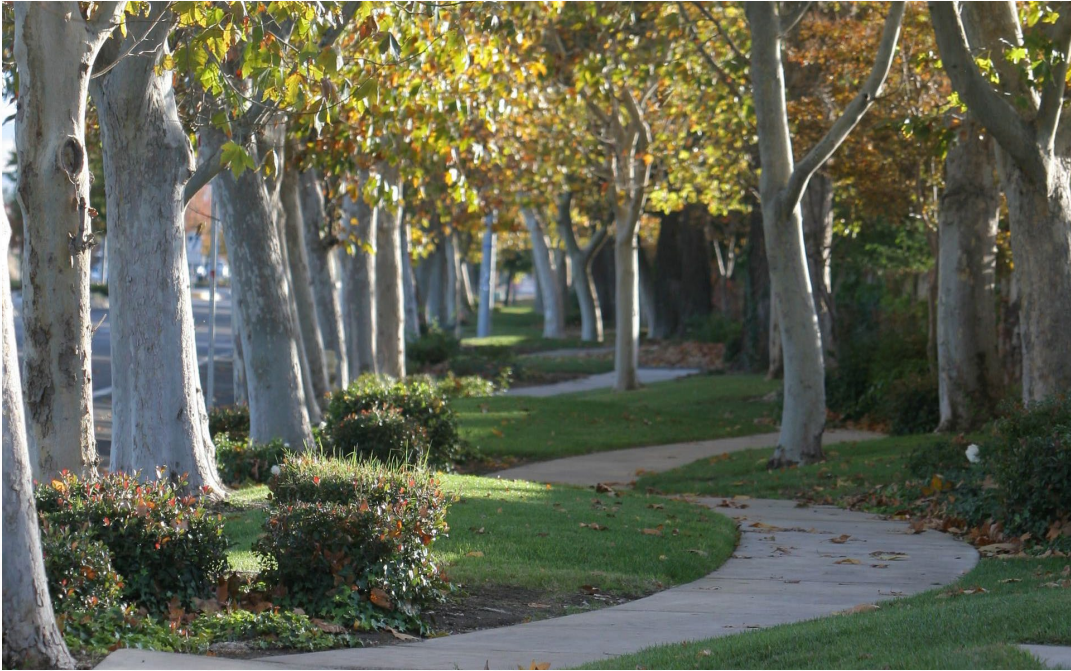
Photo: Sycamore Pkwy