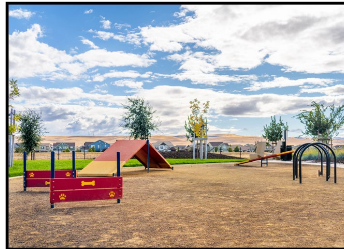
Duke's Dog Park