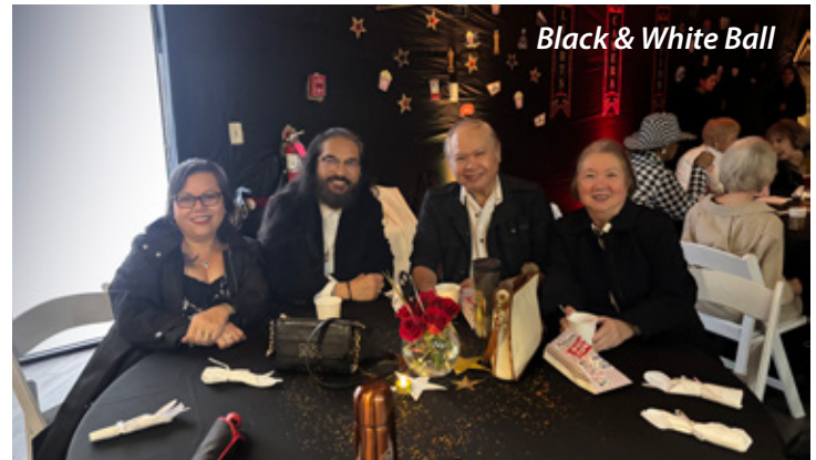
Black & White Ball