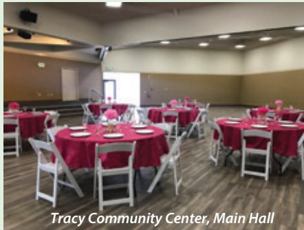
Tracy Community Center, Main Hall

We offer meeting rooms, banquet halls, and other spaces for all occasions for group sizes ranging from 12 to 550 people. A/V and Public Wi-Fi access available at some facilities.