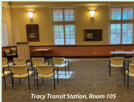
Tracy Transit Station, Room 105

NOTE: Facility use permits are required for any event that includes 50 or more guests, alcohol, or other special amenities such as food vendors or bounce houses. For a complete listing of Tracy's parks and amenities, visit our website at www.cityoftracy.org